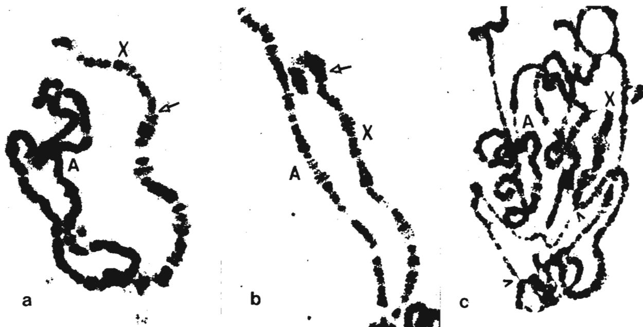
Fig. 1. Autoradiograms showing ^3H -TdR labelling on X chromosomes in comparison to the pattern on the autosome in (a) 1.62 X chromosomal segment (b) 2.15 X chromosomal segment and (c) in metaphemale (3X;2A). A=autosome, X=X chromosome. Arrow indicating the break points.

karyotypic conditions (Maroni & Plaut 1973; Annaniev & Gvozdev 1975; Lucchesi 1977) as well as different Drosophila species (Mukherjee & Beermann 1965; Lakhota & Mukherjee 1970, 1972; Abraham & Lucchesi 1973; Mukherjee & Chatterjee 1976; Das et al. 1982) points to an intriguing relationship between relative diameter, level of transcriptive activity and duration of replication of the X chromosome. Still today, several models have been proposed (Mukherjee 1974; Lucchesi 1977; Davidson & Britten 1979; Mukherjee 1982) to explain the regulatory